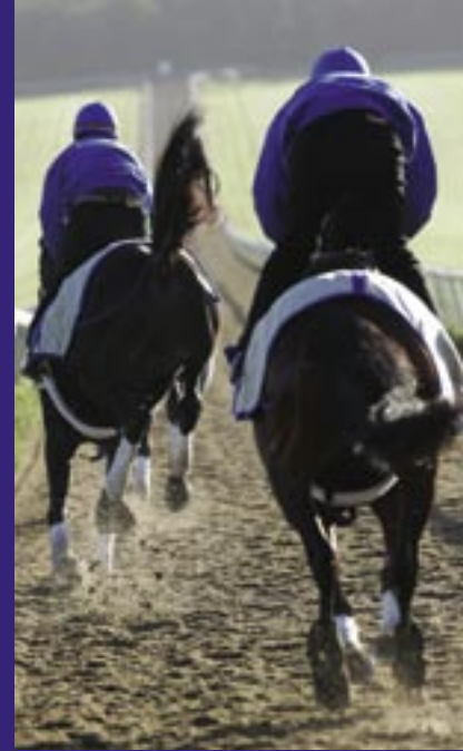
Monday morning on Warren Hill, Newmarket