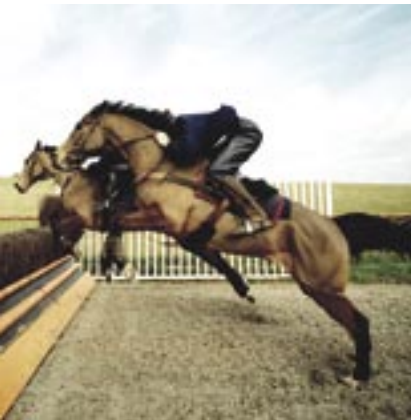
Polytrack Jumping Training Facility, Phillip Hobbs, Somerset, UK

CLOPF™ is a recent addition to the Martin Collins range. It is a polypropylene fibre which can be added to existing surfaces to create a root structure, giving the surface more stability and the horse more energy return as a result. The fibre has been sold extensively and has been extremely successful.