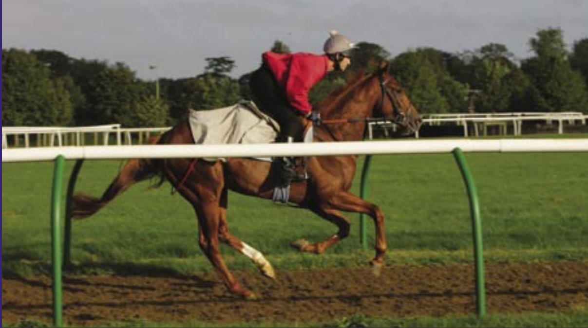
Rubbing House Gallop, Newmarket