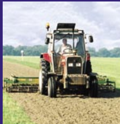
The Gallop Master