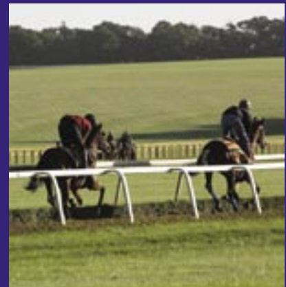
Long Hill Gallop, Newmarket