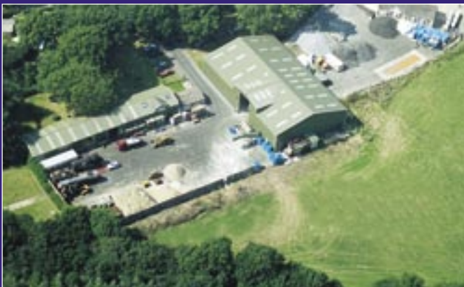
The Factory, Lambourn, UK