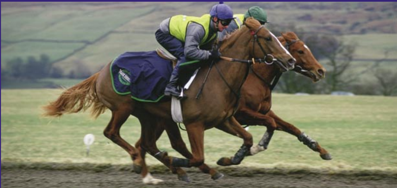
Middleham Gallop, North Yorkshire