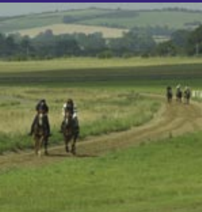
The Curragh, Co. Kildare